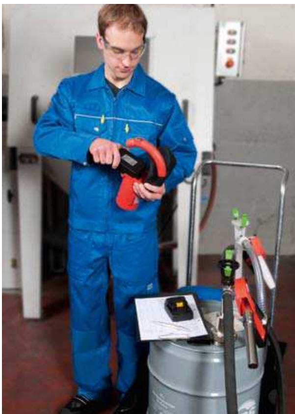
Minimal interruption of work due to replaceable battery.