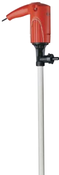
JUNIORFLUX F 310 (see page 4)