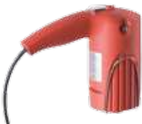
FEM 3070 (see page 5)