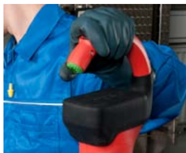
Variable delivery rate due to stepless speed adjustment.