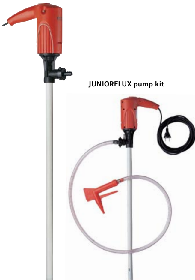
JUNIORFLUX pump kit