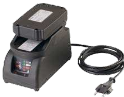
Fully recharged within 30 minutes.