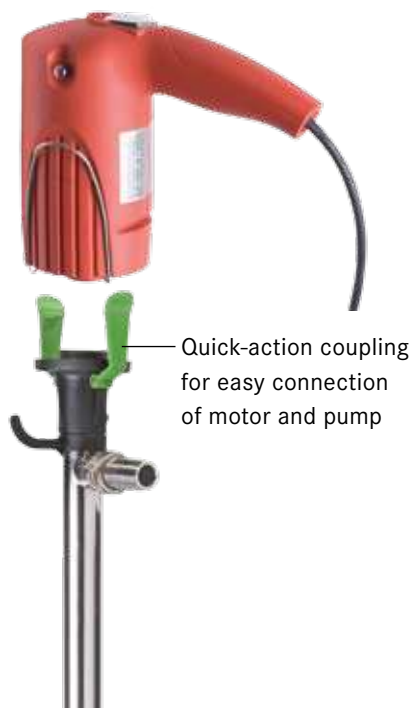
COMBIFLUX with FEM 3070

The small sealless drum pump COMBIFLUX FP 314 can be combined with the collector motor FEM 3070 (with mains connection). It is of a modular design, so that several pumps can be operated in series with one motor. Like the JUNIORFLUX, the COMBIFLUX is especially suitable for pumping comparably small quantities out of containers such as canisters or drums of up to 200 litres. The small outer tube diameter allows pumping even out of narrow openings.