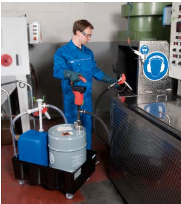
High mobility due to battery motor.