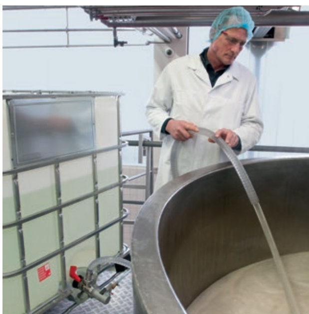
Pumping upward into a mixing container from the IBC outlet.