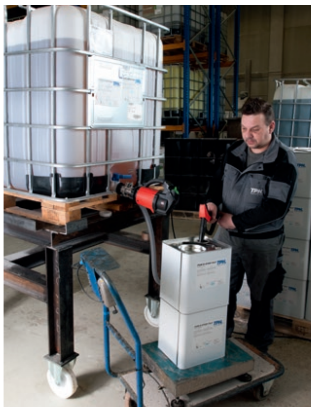
Fast container filling from the IBC outlet.